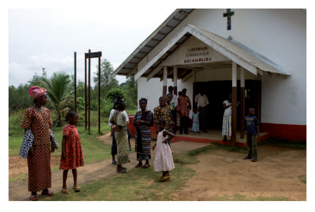
The church is ideally placed to play an active role in addressing sexual violence.

In some countries, such female leaders have been documenting cases of sexual violence and seeking to bring perpetrators to justice, while offering care and counselling for survivors.