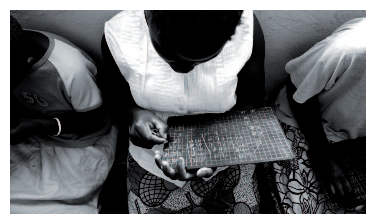
Young women receive basic education at the HEAL Africa facility in Goma, Congo. Education is an integral part of recovery for victims of sexual violence who have been ostracised by their families and home communities.

It doesn't have to be like this. In Rwanda, churches generally support survivors of sexual violence, providing prayer, counselling, comfort and training on the issue.