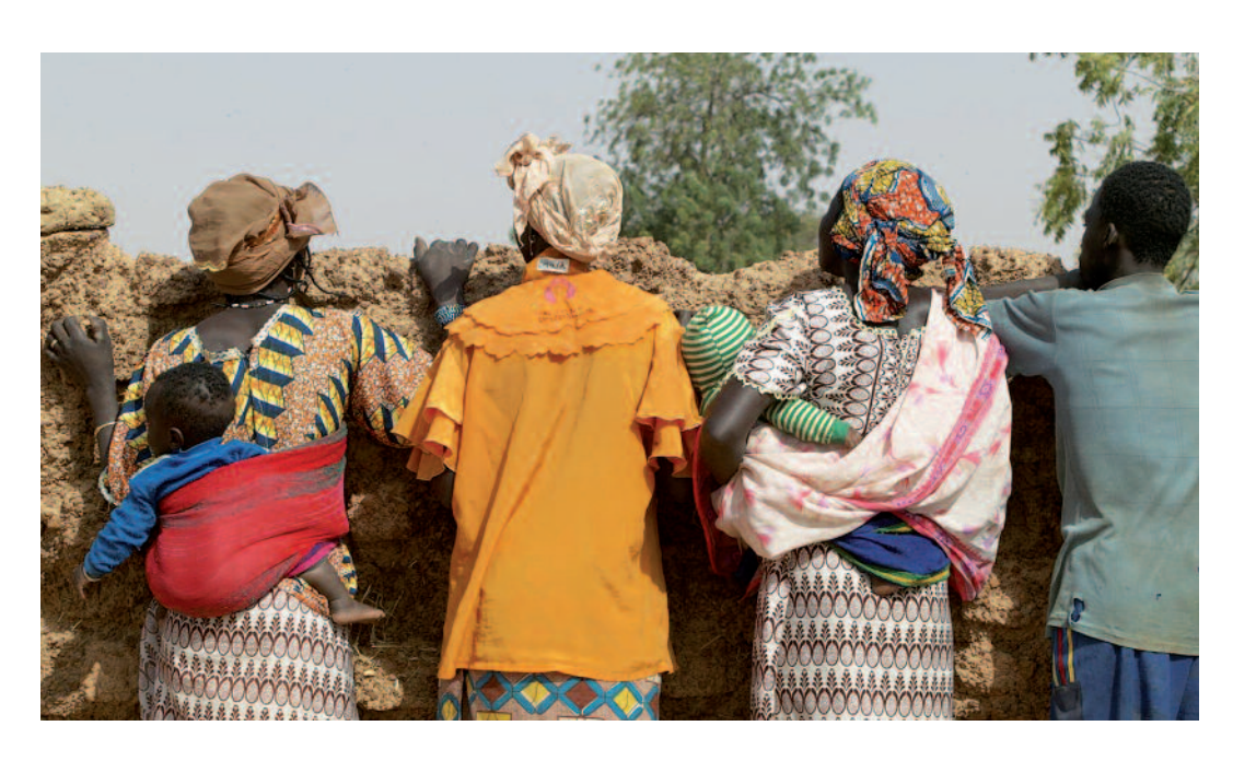
Families and communities need help to raise awareness, overcoming stigma and identifying positive ways of responding.

12 THE CHURCH'S ROLE WHAT CAN BE DONE 13