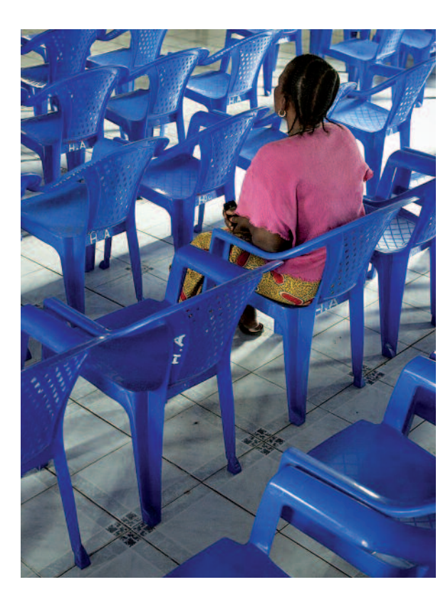
HEAL Africa has been working for many years, providing emotional, medical and practical assistance in collaboration with local churches.

If the church breaks the silence, it will enable them to talk about what happened too. But so far, most church leaders and members see addressing sexual violence as being outside the church's mandate. In most contexts, it's not perceived as the church's concern.